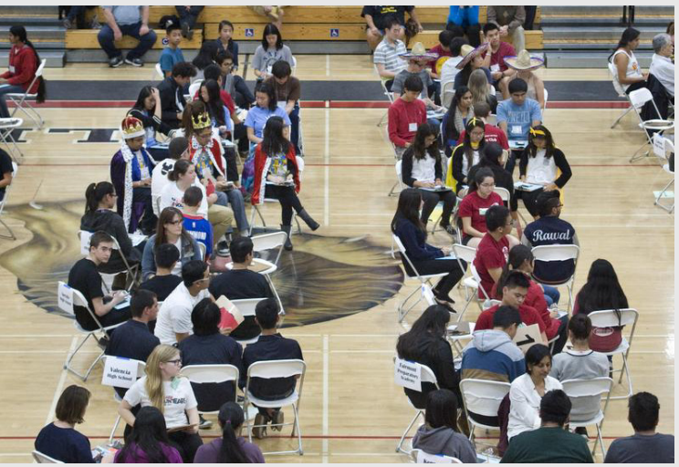
The exciting live-audience Super Quiz Relay then and now! Left: 1973, Bolsa Grande High School. Right: 2016, Westminster High School.